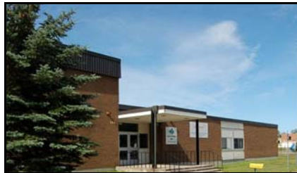
Schreiber Training Centre