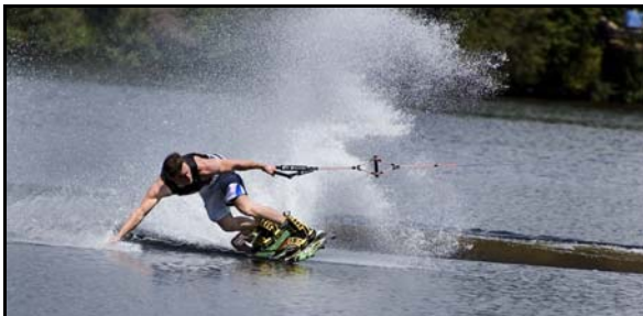
Wakeboarding at Whitesand Lake