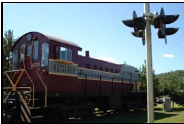
Schreiber Rail Array Museum

The information presented within this document has been compiled from sources deemed reliable. While every attempt has been made to ensure the accuracy of this guide, some information is subject to change without notice. This guide is intended as an information source and does not imply endorsement of any service, association or organization.