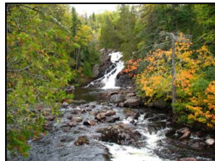
Rainbow Falls Autumn Colours

Thunder Bay Regional Hospital (within 225 km) provides comprehensive healthcare delivery through 1,933 staff and 250 physicians. Total number of beds 355. Thunder Bay is also the major referral centre for Northwestern Ontario