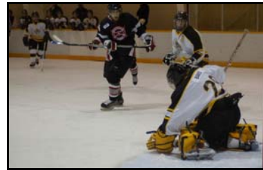
SIJHL Champ Schreiber Diesels